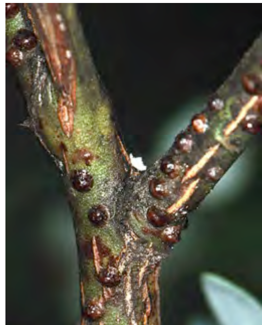
Figure 6. Putnam scale