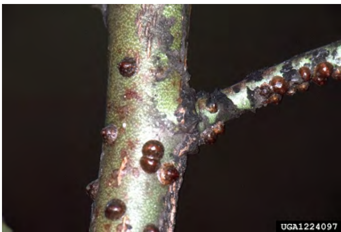
Figure 3. Terrapin scale