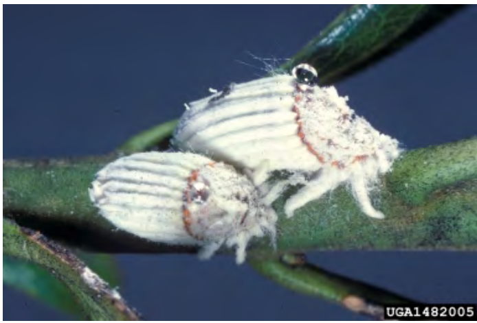
Figure 1. Cottony cushion scale