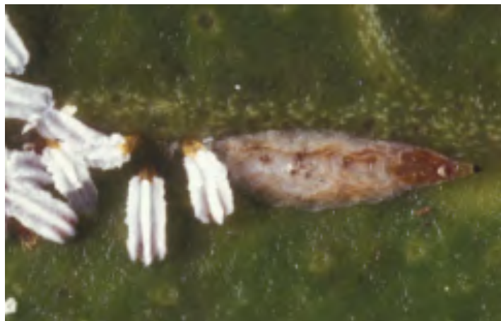
Figure 7. Male tests and female Lesser Snow scale