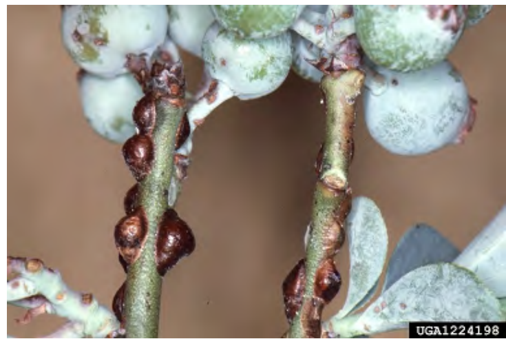
Figure 4. European fruit lecanium