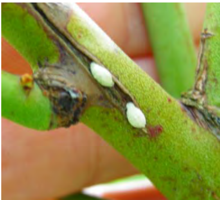
Figure 5. Azalea bark scale