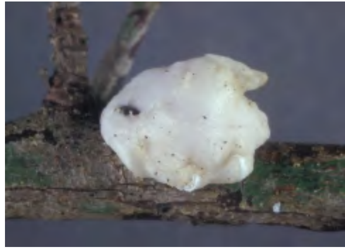
Figure 2. Indian Wax scale.