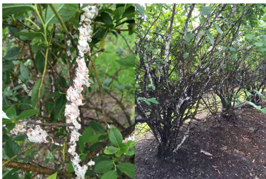
Figure 8. Scale infestations observed in blueberries during 2015