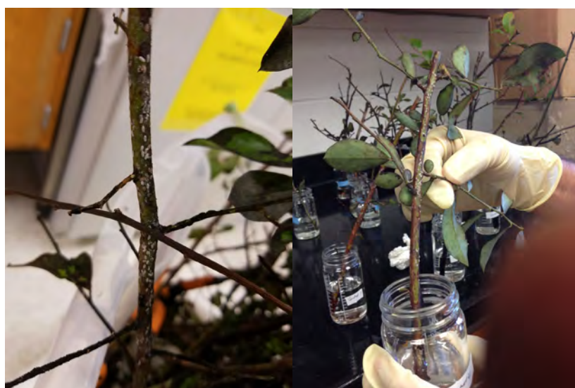
Figure 9. Scale infestations observed in blueberries during 2016