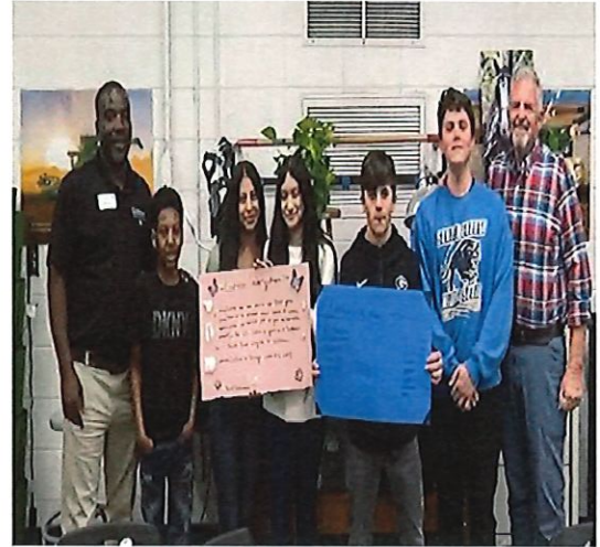
Sumter County 4-Her's prepping for upcoming Cotton Boll Consumer Judging Competition, that takes place on November 6, 2024, Tifton, Georgia.