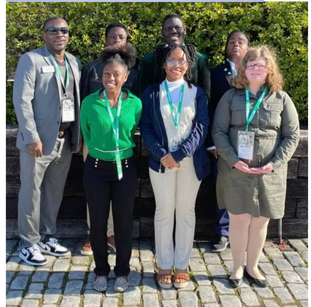
February 25, 2025 – Atlanta, GA