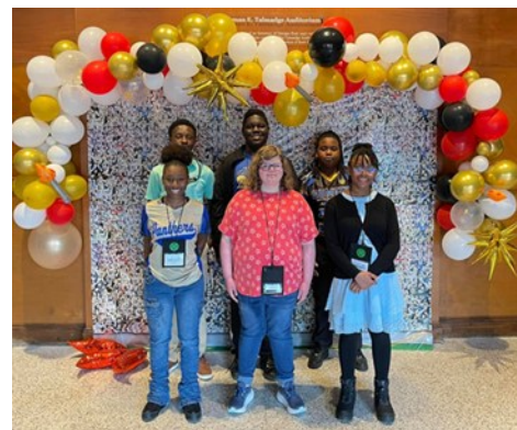
Southwest District 4-H Jr/Sr DPA February 7-9, 2025 at Rock Eagle