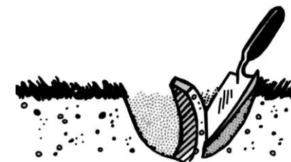
Figure 3. Soil sampling with a trowel.

Use clean sampling tools and containers to avoid contaminating the soil sample. Never use tools or containers that have been used for fertilizer or lime. Collect samples with tools like trowels, shovels, spades, hand probes, or hand augers.