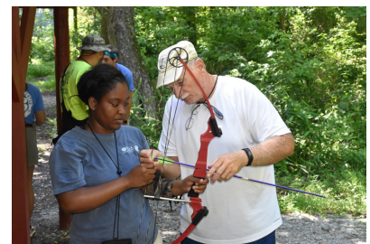
PHOTO RELEASE STATEMENT

By submitting photographs to the Georgia 4-H Photo Contest (either on your own or through your local County Extension Office), you certify that you are the individual who took the photograph(s) submitted, that you own the copyrights to the photographs and that you have the authority to enter into this release. You release Georgia 4-H from any liability that arises from the use of the photographs except for uses that violate the terms and conditions of this release. You agree to work in good faith with Georgia 4-H to promptly resolve any problems or disputes that may arise due to your submission of the photographs. By entering your photographs in the Georgia 4-H Photo Contest, you grant Georgia 4-H the royalty-free and non-exclusive right to use your photographs as follows: (i) on the Georgia 4-H/Georgia 4-H Foundation websites; (ii) for Georgia 4-H/Georgia 4-H Foundation posters, brochures, activity guides, and/or any other printed or electronic publications; (iii) in Georgia 4-H/Georgia 4-H Foundation electronic emails; (iv) and in any other internal or external marketing materials or media coordinated by Georgia 4-H/Georgia 4-H Foundation. You further waive the right to inspect or approve the final use of your photographs by Georgia 4-H/Georgia 4-H Foundation.