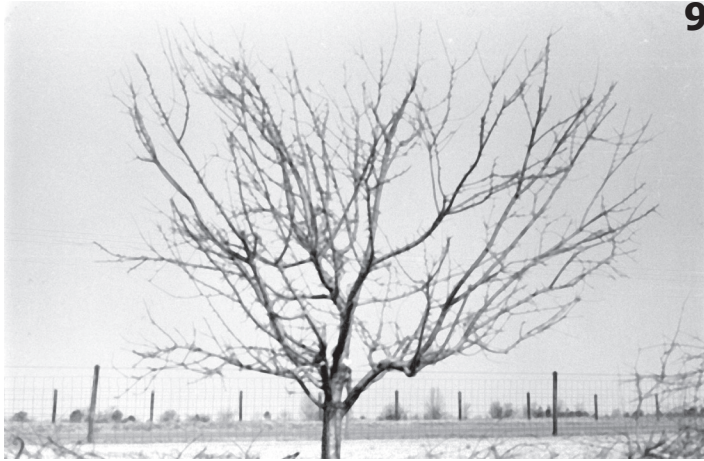
Figure 9 is the same tree after the first season's pruning. The next year, it will be necessary to remove more limbs, especially on the left side. Note that most of the cuts were thinning types; that is, the wood was removed to its base or point of origin. When making these thinning cuts, make sure the cuts are flush along another limb.

The remaining limbs can be pruned back by one-fourth of their length to a side limb if it is desired to stiffen them. If you don't cut them back, the limbs may bend and/or break under a heavy crop load.