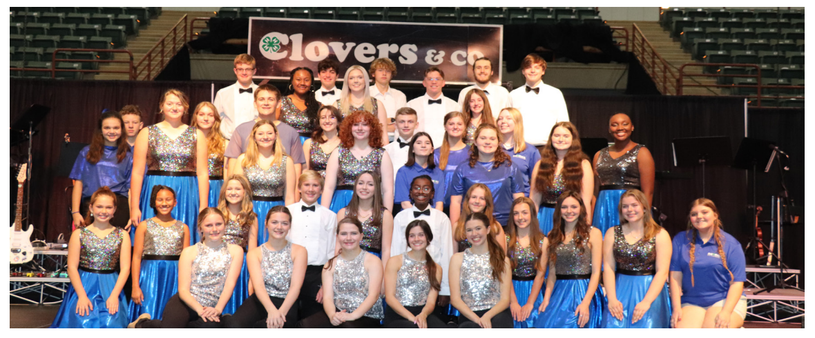
Clovers & Company at the 2022 Georgia National Fair

Clovers and Company represents the best performing talent in 4-H. Clovers members are selected through auditions annually. All 4-H'ers, age 9-19, are eligible. The group performs throughout Georgia and is nationally acclaimed, having performed from Chicago to Florida, and from Washington, D.C. to Alabama. The show is 45 minutes long and features singers, dancers, and a live band.