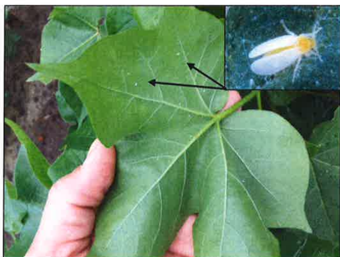
Adult SLWF Infestations: leaves are considered infested if 3 adult SLWFs are observed. After counting adults detach the leaf from the main stem.