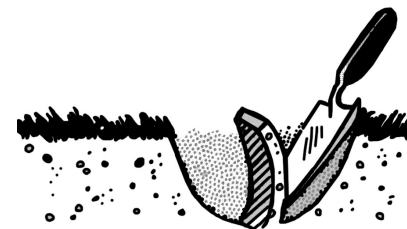
Figure 3. Soil sampling with a trowel.

Use clean sampling tools and containers to avoid contaminating the soil sample. Never use tools or containers that have been used for fertilizer or lime. Collect samples with tools like trowels, shovels, spades, hand probes or hand augers.