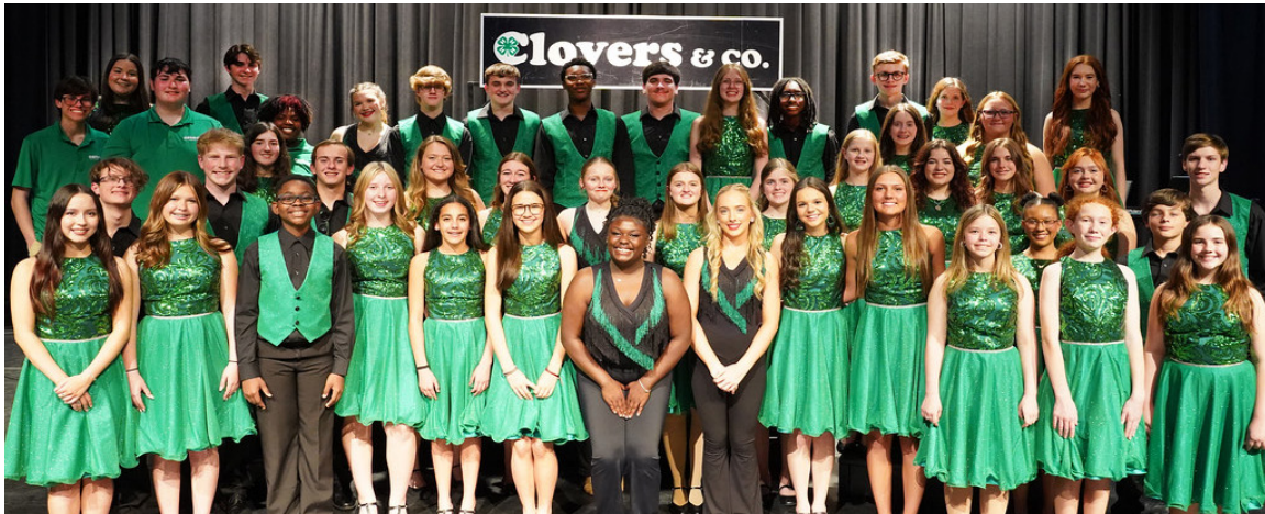
Clovers & Company 2024-2025

Clovers and Company represents the best performing talent in 4-H. Clovers members are selected through auditions annually. All 4-H'ers, age 9-19, are eligible. The group performs throughout Georgia and is nationally acclaimed, having performed from Chicago to Florida, and from Washington, D.C. to Alabama. The show is 45 minutes long and features singers, dancers, and a live band.