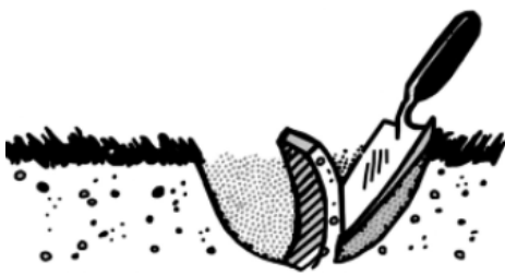
Figure 3: Soil sampling with a trowel.