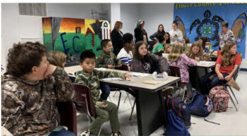
ELEVATE Practices Gratefulness

Spend your afternoon with us learning, completing projects, enjoying fun activities and eating snacks! You are sure to love this engaging and interactive time in the 4-H Clover Room and BEYOND! Meetings are held monthly afterschool until 5:00pm . A ride must pick you up at ECMS. Tuesday, December 13th is our last meeting of this semester. This club is sponsored by Elbert County Farm Bureau and assisted by Keep Elbert County Beautiful. You don't want to miss it!