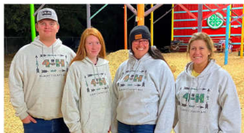
Hoodies in the 4-H Barn at the Fair