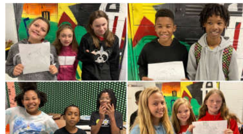
Young Riders Present Plans

If you like horses, make plans to join the Young Riders Horse Club! This afterschool club will meet once a month to learn & have fun! You do NOT have to own or ride a Horse to participate in this Club! Meetings are held in the Clover Room at the Elbert County Middle School, afterschool until 5:00pm . Fall meeting dates are: Monday, November 28th, and Monday, December 12th .