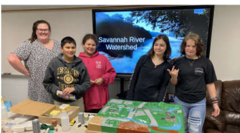
"Earthies" Study Watersheds

6th GRADE ONLY . If you love earth science, then this activity is for you! Join us after school in the Clover Room as we expand on our knowledge of earth science in fun, engaging activities. We will meet again on Thursday, December 1st . A ride must pick you up at 5:00pm in