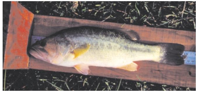
Measuring a fish properly

This bass weighs 83 percent of the standard weight of a bass the same length.