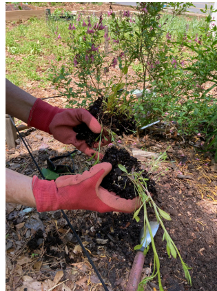
Step 2- gently separate each plant.