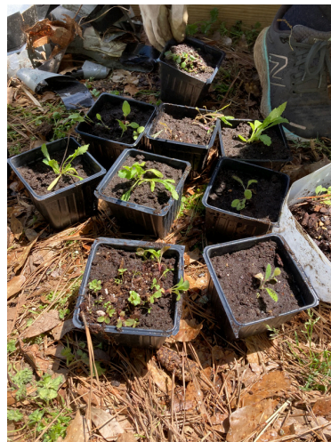
Step 3- plant in the ground or into pots.