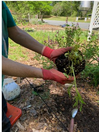
Step 1-carefully pull the soil mound out of the jug