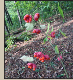
Hearts a' burstin'