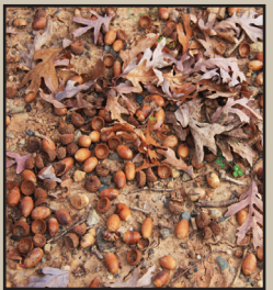
White Oak Acorns