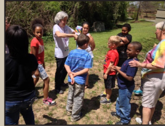
Group Tours for Children and Adults