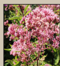
Joe Pye Weed

A Project by the Master Gardener Extension Volunteers of Coweta County