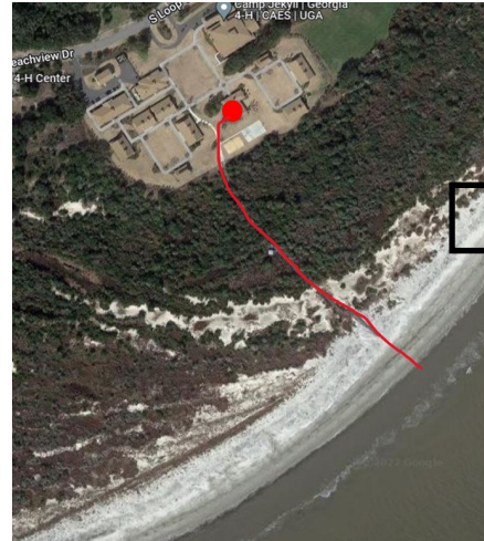
Camp Jekyll 2020