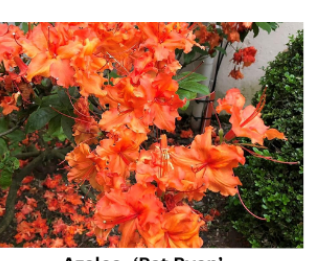
Azalea- 'Pat Ryan'