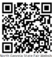
North Georgia State Fair Website