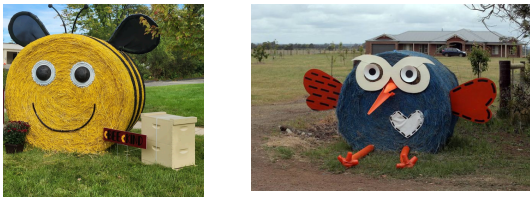
Exhibit Fair Prize Drawing

Youth Participation is what this is about! Registration is FREE! Due by Tuesday, September 3rd.