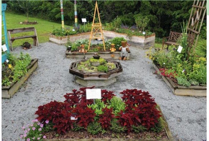
Demonstration gardens provide examples of plots people can create in their own gardens.

The Georgia Master Gardener Extension Volunteer program has created a comprehensive garden guide , including a 2024 garden passport, to help visitors plan garden stops around the state.