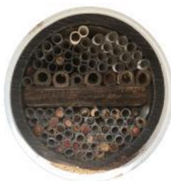
Mason Bee Paper Tubes

If you want to help pollinators while maintaining a neat yard, there is good news. Many of the resources that pollinators need, including nesting locations, can be attractive additions to your landscape. In Europe, nesting boxes can host over 15% of native bee species (Fortel et al. 2016). When bees have access to a diversity of nesting materials, their numbers are positively affected, so providing nesting resources in your landscape is very beneficial to bees (Potts et al. 2003).