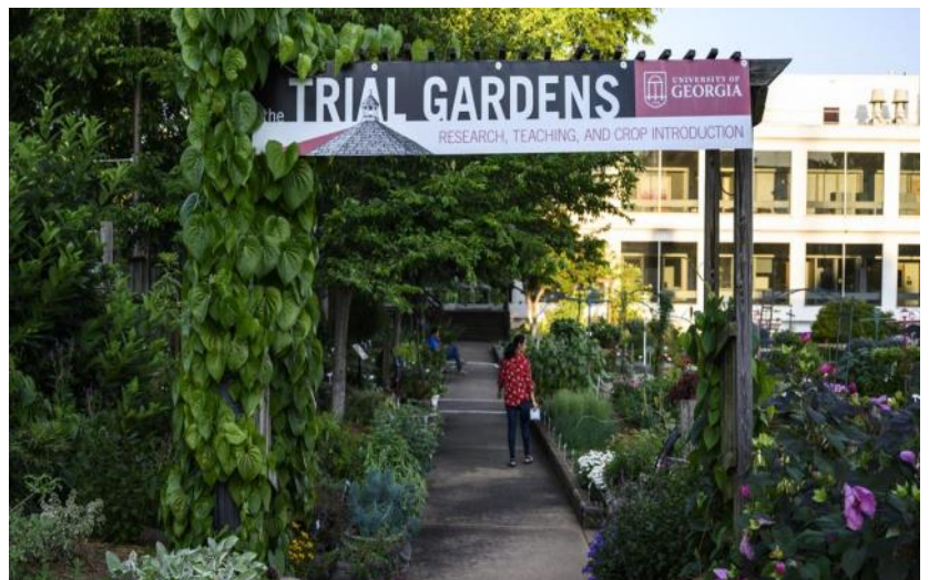
Entrance to Trial Gardens, UGA