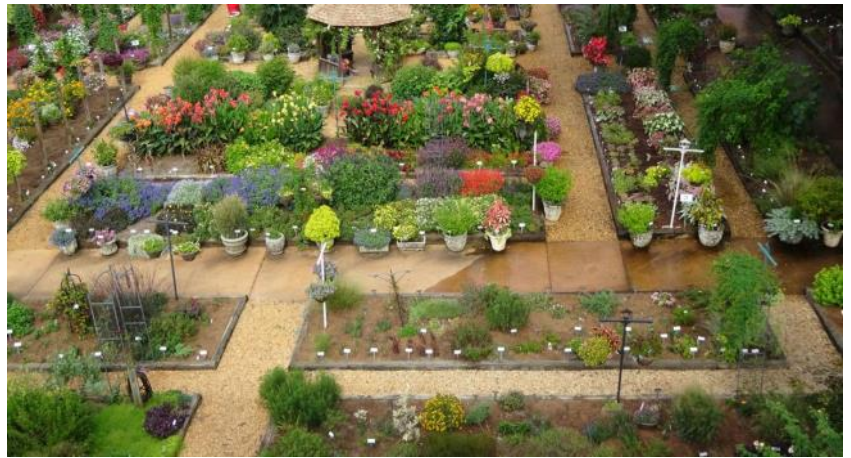
Aerial photo of Trial Gardens, UGA