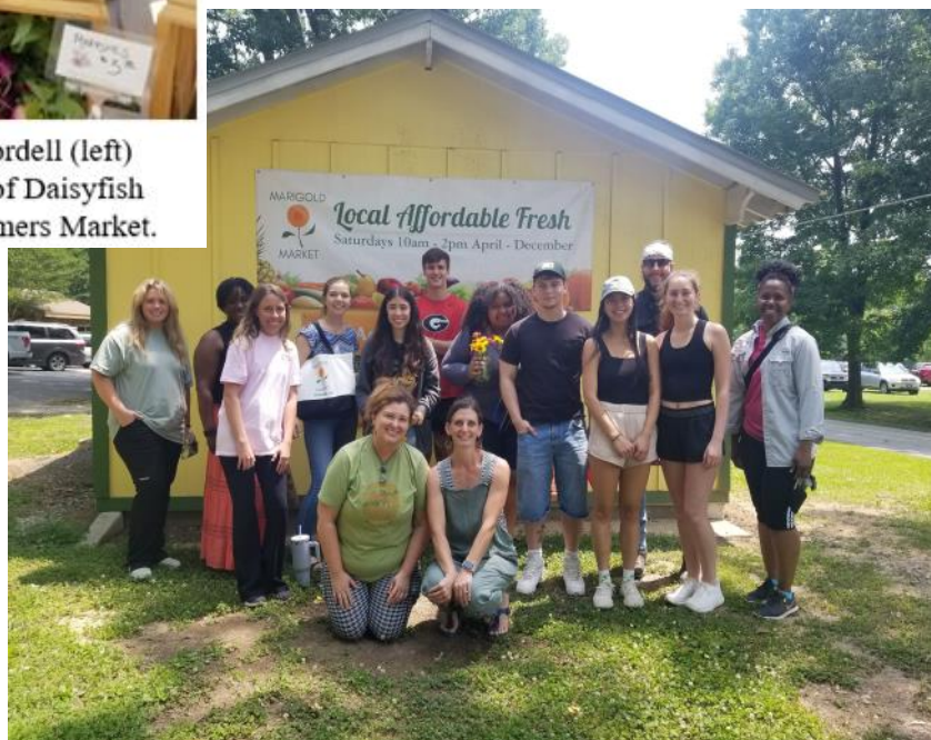
Below: REEU Fellows at the Marigold Market