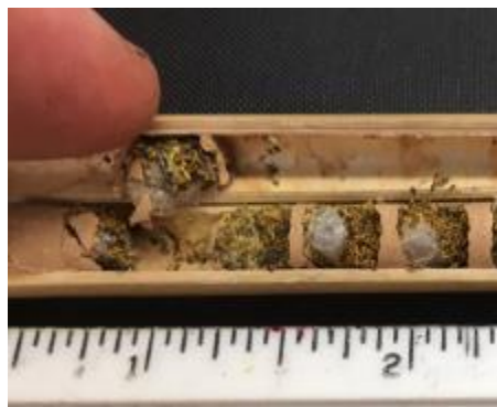
Mason Bee nest cells

Mason bees received their name because they often use mud during nest construction. In the spring, male mason bees emerge first and wait for females to emerge so that they can mate. Shortly after mating, the males die. Females search for an appropriate nesting site and begin preparing the nest. A cavity or hole will have