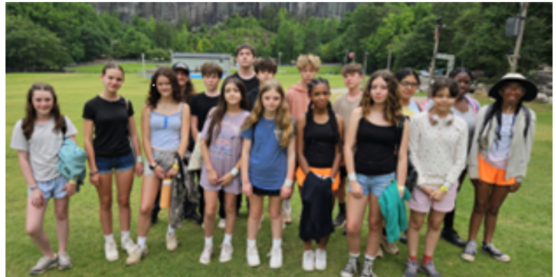
2025 Junior Camp Group

Plans are already underway for 2026 4-H Summer Camp! Sixth grade students will camp at Rock Eagle 4-H Center the week of June 22–26. Seventh and Eighth grade students will have the opportunity to camp at Burton 4-H Center near Tybee Island. the week of June 8–12. Mark your calendars and begin making plans now! Summer will be here sooner than you can imagine. Information will be available in January.