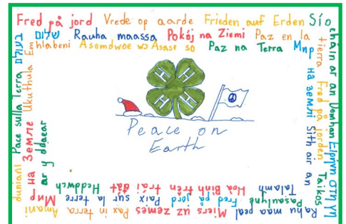
Last years winning entry

Here are a few helpful hints to make your holiday card: Use a universal December holiday theme such as "Happy Holidays" or "Seasons Greetings" rather than focusing on Christmas, Hannukah or another winter holiday, We want everyone to enjoy the card no matter holiday they celebrate.