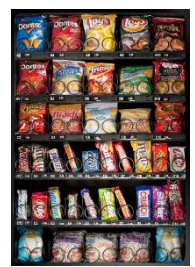
Vending Machine Snacks