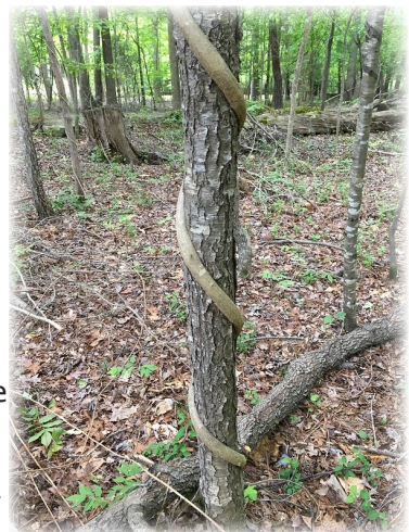
Wisteria floribunda clockwise vines

Sadly, as beautiful and stunning as they are, the Chinese and Japanese wisterias are known for destroying native trees and shrubs. The vines girdle the trees, killing them. The large mass of vines creates canopies of dense shade, killing many native plants and decimating native ecosystems.