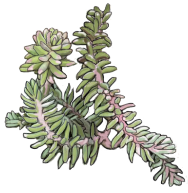
sedum

Not all sedums grow with the same vigor, so if you are combining several in a container keep this in mind. An aggressive sedum will choke out a slower growing, less aggressive cultivar. I put each in their own container and then place the containers beside each other.