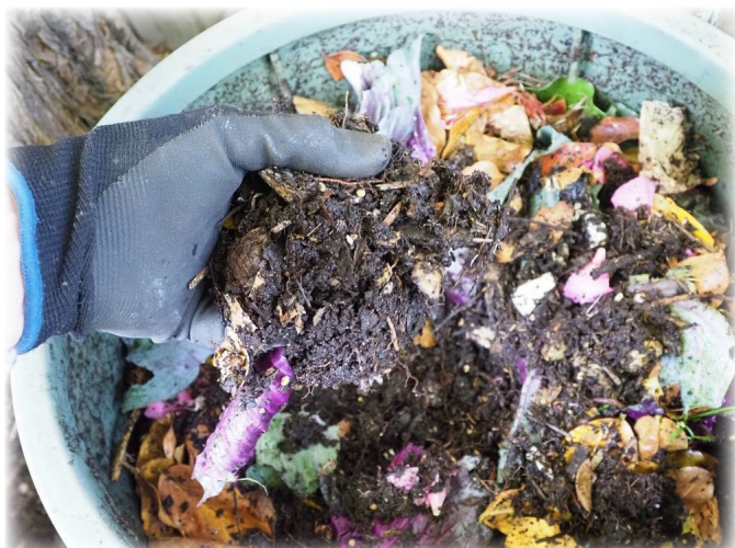
Worm bin contents

Worm composting requires a worm bin, worms, bedding, and food scraps. Worm bins are easy to make using either plastic storage bins with lids or wood. Both types must have drainage holes. Plastic bins work best indoors because their temperature can be hard to regulate outdoors. Wooden bins should be 1 foot deep by 2 feet wide by 3 feet long. Drainage holes should be drilled in the bottom.