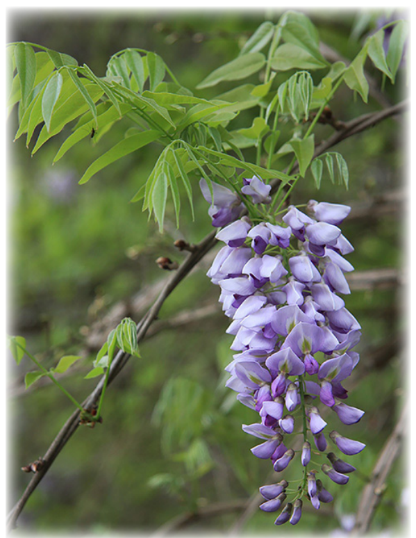
Wisteris frutescens

The flowers are borne in racemes of varying length depending on the species. The flowers can be lilac, purple, blue, pink, or a rare white in color. The leaves are pinnate and alternate with 8- to 9-inch leaves. Leaflets average from 9 to 19 in number, again depending on species.