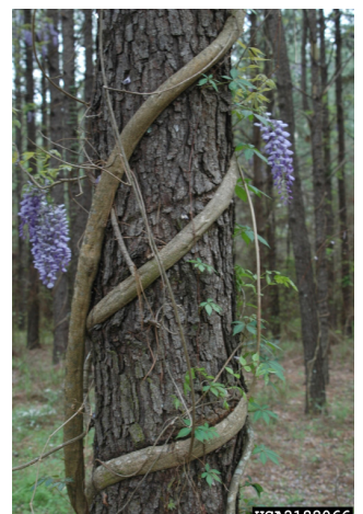
Wisteria sinensis counterclockwise vines

Pods form after the flowers and contain one to four seeds. Both the pods and the seeds are very toxic to humans and animals. Wisteria can spread from seed, underground roots and shoots, and the movement of seeds via water ways. The vines can grow up to 10 feet in a season. They are nitrogen fixing plants, which means they can improve soil quality. Due to their vigor, most wisterias will not grow well in pots. With intense maintenance, a wisteria vine can be groomed to be a tree.