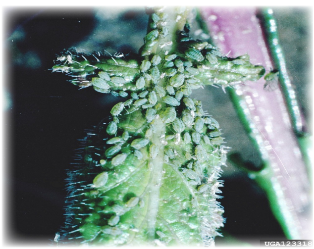
Aphid infestation on a rose.