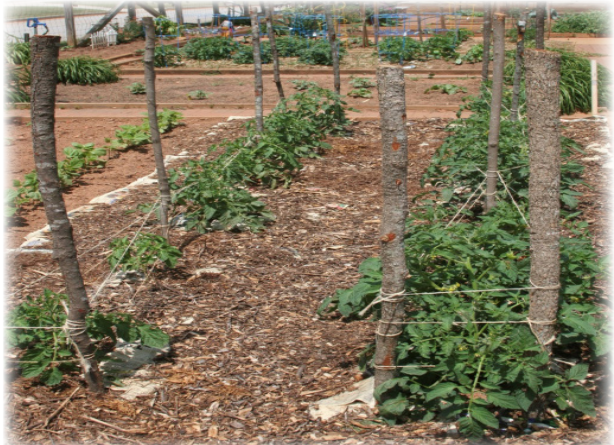
Florida weave tomato stake method described in web link