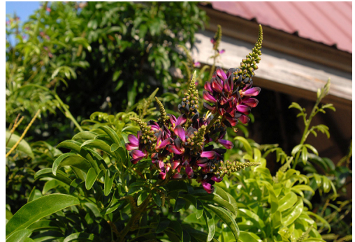
Callerya reticulata

American wisteria is more cold tolerant than the non-native species. It also has smaller, smooth pods and only reaches heights of 15 to 25 feet. The vines are not as woody and strong as the non-native species and are easily trained to trellis or fences. American wisteria is the larval host to the silver spotted skipper and the longtail skipper butterflies. The blossoms attract many other butterflies and bees. It is deer resistant, likes acidic soil, and can grow in full sun or part shade.