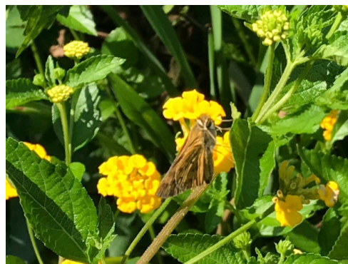
Skipper on annual lantana ( Lantana camara )