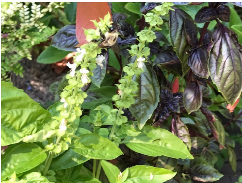
Bumble bee on basil, photo by Marcia Winchester

HELP SHOW THAT CHEROKEE COUNTY IS CREATING A POLLINATOR FRIENDLY COMMUNITY BY REGIS- TERING YOUR GARDEN WITH OUR POLLINATOR SPACES PROGRAM