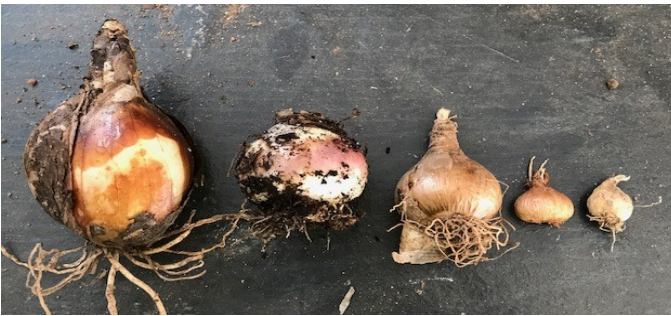
From left to right: Lycoris radiata /spider lily, Hyacinth , Narcissus/Daffodil , Crocus , Muscari armeniacum /Grape hyacinth