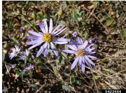
aster ( Symphyotrichum sp.)