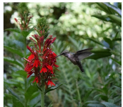
Hummingbird on cardinal flower

It’s not too late to register your garden as a Cherokee County Pollinator Garden.