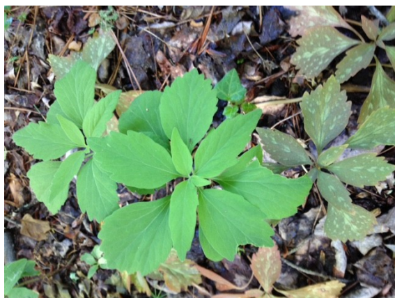
Pachysandra procumbens