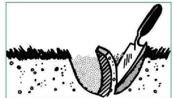
Figure 3. Soil sampling with a trowel.

Push the handle forward, with the spade still in the soil to make a wide opening. Then, as shown in Figure 3, cut a thin slice from the side of the opening that is of uniform thickness, approximately \frac{1}{4} inch thick and 2 inches in width, extending from the top of the ground to the depth of the cut. Collect from several locations. Combine and mix them in a plastic bucket to avoid metal contamination. Take about a pint of the mixed soil and place it in the UGA soil sample bag. Be sure to identify the sample clearly on the bag and the submission form before mailing.