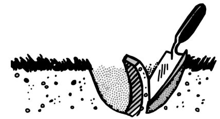
Figure 3. Soil sampling with a trowel.

Use clean sampling tools and containers to avoid contaminating the soil sample. Never use tools or containers that have been used for fertilizer or lime. Collect samples with tools like trowels, shovels, spades, hand probes or hand augers.