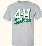
Short Sleeve T-Shirt $12

Show your 4-H Spirit with our NEW Bulloch County 4-H Shirts, Sweatshirts, and Cups!