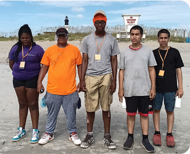
4-H'ers visiting Tybee Island for the day