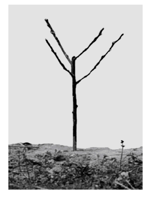
Figure 2. Scaffold selection for the opened center system to train stone fruit trees such as peaches, plums and nectarines.

Head the tree to 20-24 inches from the top of the soil surface to encourage low branching, and balance the scion and root growth. Remove any lateral branches, which were formed on the trees at the nursery below 24 inches from the ground, to encourage growth of new