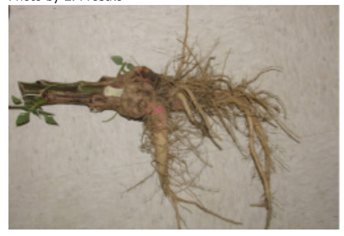
Figure 3. The extensive Palmer amaranth root system.

Implications for management: Because of its rooting structure, Palmer amaranth may have more access to water and nutrients than many commonly grown crops. This contributes to Palmer amaranth's rapid growth and competitiveness. The presence of a taproot can make it difficult to remove Palmer amaranth by hand. Broken-off stems as small as 1 inch can resprout, flower and produce seed.