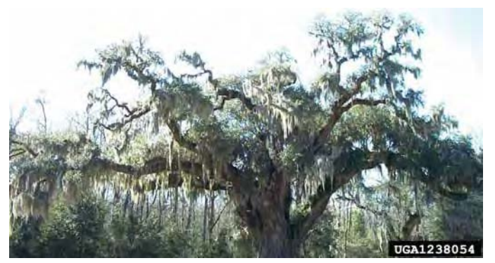
Fig. 3. Moss only uses a tree for protection and support