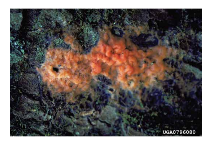
Fig. 2. Orange plasmodium on a tree.

Spanish moss ( Tillandsia usneoides ) is an epiphytic plant found growing mainly on hardwoods throughout the Southeast. It is not a plant parasite and only uses the tree for support and protection (Fig 3). Instead, it makes its own food. Spanish moss has long slender stems that wrap around the tree allowing it to hang in the air (Fig 4).