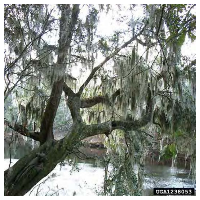
Fig. 4. Long, slender stems used to catch water and nutrients grow from the bark.