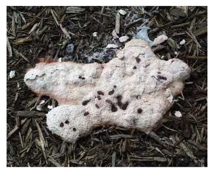
Fig. 1. Shapeless "blob" or plasmodium.

Slime molds 'creep' along slowly but may travel up to several feet a day. Slime molds do not cause any direct injury to plants but may inhibit photosynthesis if the plasmodium is thick and persistent. As weather