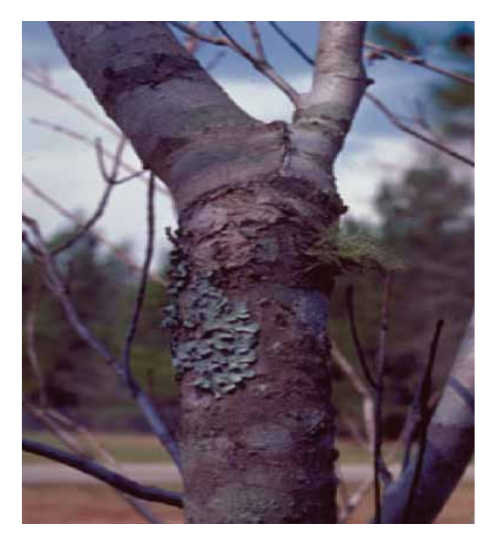
Fig . 5. Lichens obtain water and nutrients fro air and the microbes on bark.