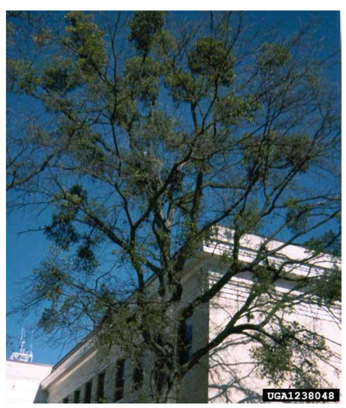
Fig. 7. Mistletoe germinating through bark.

Mistletoe is an evergreen parasitic plant found on a wide host range including alder, birch, cottonwood, maple, oak, and zelkova among others. Mistletoe obtains water and minerals from the host but it is not totally dependent. Leaves of the mistletoe contain chlorophyll and are capable of making their own food from carbon dioxide and water like other plants. Birds feed on the berries produced and excrete them to new