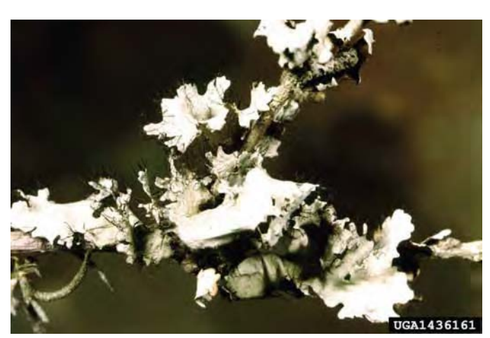
Fig. 6. Lichen on a declining tree

The alga or cyanobacterium converts sunlight and carbon dioxide to food for the lichen fungus and in return the lichen fungus protects the alga/cyanobacterium from drying out. The fungus obtains water and minerals from the air and the material it is growing on (Fig 5). The alga provides carbohydrates and vitamins. Some blue-green algae fix nitrogen that is used by