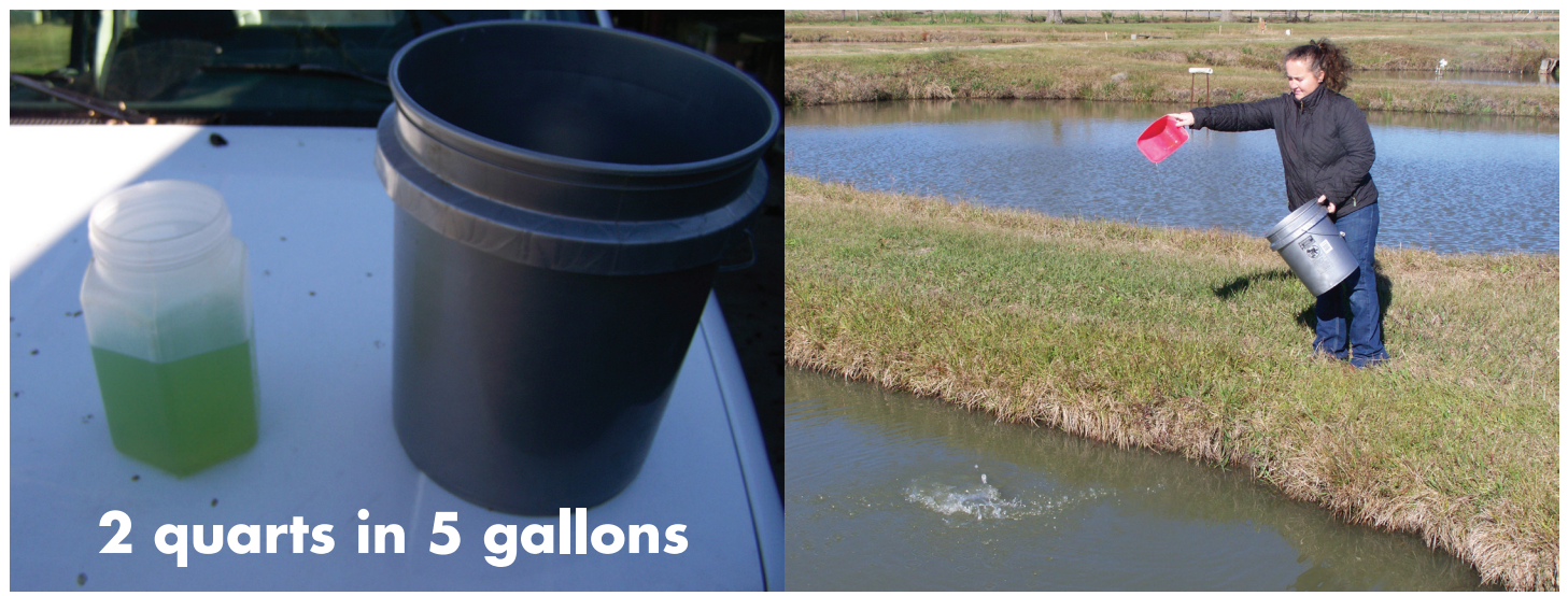
Figure 1. Dilute liquid fertilizer 1:10 with water before application to ponds.

Apply fertilizer so that the dissolved nutrients will stay in the pond water as long as possible before entering the pond soil. Granules and heavy liquid fertilizers sink directly to the pond bottom if broadcast straight from the container. Clay in pond soil binds phosphorus and most added phosphorus ends up in the pond bottom eventually. So, dissolve the heavy liquid fertilizer in 10 parts water before application (Figure 1). Position granular fertilizers so they will slowly dissolve from a wooden platform or plastic sheet. Consider using a soluble powdered fertilizer if you want to broadcast fertilizer over the pond surface. Some pond fertilizer is sold with a plastic tray or bucket to hold granular fertilizer until it dissolves into pond water. Liquid fertilizers are very popular because they are usually easier to apply to ponds than granular or powdered pond fertilizers.