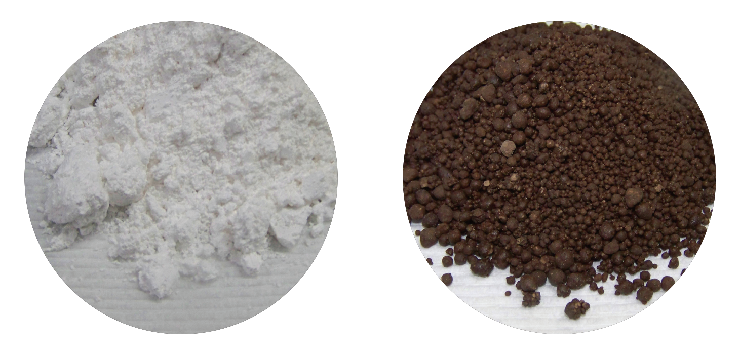
Figure 2. Finely powdered lime (left) and pelletized lime (right) dissolve over several months in pond water.

After the initial lime application, pond water hardness will change over a period of several months. Rainfall, water from soft water wells, springs, or streams will dilute the hardness in ponds so that liming may need to be repeated. Lime requirement should be checked periodically and lime usually needs to be reapplied every four years.