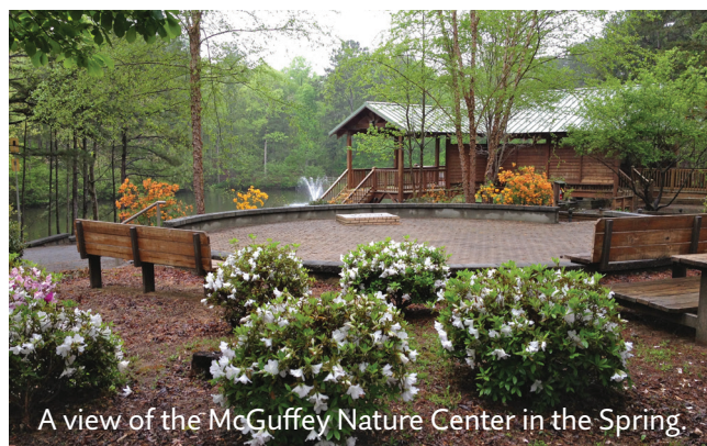
A view of the McGuffey Nature Center in the Spring.

The Coweta County Master Gardener Extension Volunteers are offering a wonderful opportunity to support the McGuffey Nature Center Project and create a lasting legacy for your family.